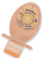
TRANS/OVERLAP NEONATAL BAG