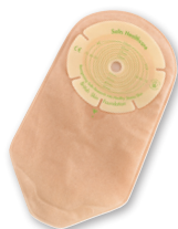
TRANS/OVERLAP STANDARD BAG

*Starter hole wafers can be cut up to 70mm wide and 55mm deep.