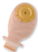
TRANS/OVERLAP STANDARD BAG