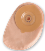
TRANS/OVERLAP LARGE BAG