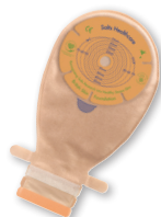
TRANS/OVERLAP SMALL BAG