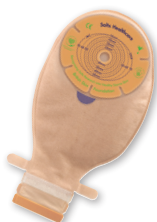
TRANS/OVERLAP STANDARD BAG