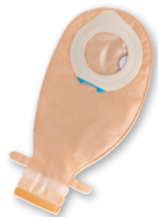
TRANS/OVERLAP LARGE BAG