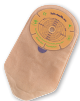
TRANS/OVERLAP STANDARD BAG

*Starter hole wafers can be cut up to 70mm wide and 55mm deep.