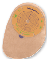
TRANS/OVERLAP LARGE WAFER

**Large wafers can be cut up to 90mm wide and 80mm deep.