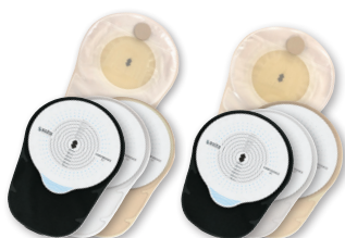
LARGE WAFERS – LARGE AND STANDARD CLOSED BAGS △