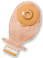
TRANS/OVERLAP LARGE BAG