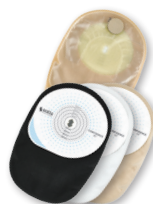
STANDARD CLOSED BAGS △