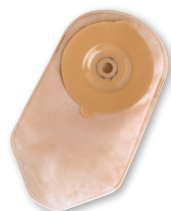
TRANS/OVERLAP STANDARD BAG