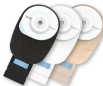
STANDARD DRAINABLE BAGS