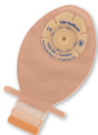
TRANS/OVERLAP PAEDIATRIC BAG