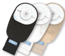
LARGE DRAINABLE BAGS