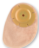
TRANS/OVERLAP LARGE BAG