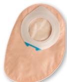
OPAQUE LARGE BAG