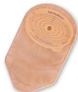
TRANS/OVERLAP STANDARD BAG

*Oval wafer bags can be cut up to 110mm wide and 70mm deep.