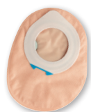
OPAQUE STANDARD BAG