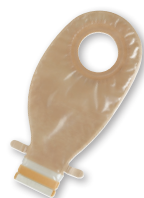
TRANSPARENT LARGE* BAG Δ

*Post-op bags with NO filter. Δ Reverse shown.