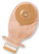
TRANS/OVERLAP STANDARD BAG