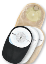
LARGE CLOSED BAGS △