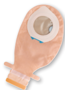
TRANS/OVERLAP STANDARD BAG