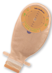
TRANS/OVERLAP LARGE WAFER

**Large wafers can be cut up to 90mm wide and 80mm deep.