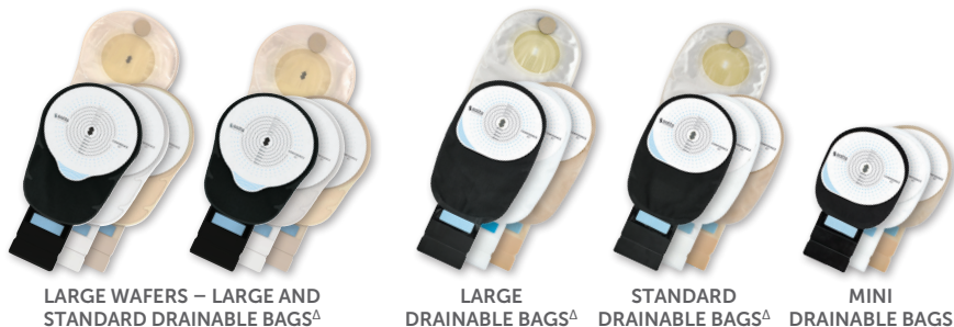
LARGE WAFERS – LARGE AND STANDARD DRAINABLE BAGS a