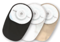
LARGE CLOSED BAGS