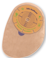
TRANS/OVERLAP LARGE BAG