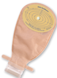
TRANS/OVERLAP LARGE BAG

*Oval wafer bags can be cut up to 110mm wide and 70mm deep.