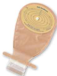
TRANS/OVERLAP STANDARD BAG