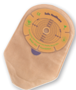
TRANS/OVERLAP SMALL BAG