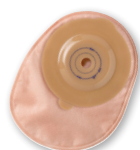
TRANS/OVERLAP STANDARD BAG