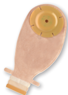
TRANS/OVERLAP LARGE BAG