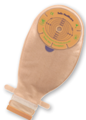
TRANS/OVERLAP LARGE BAG