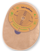
TRANS/OVERLAP STANDARD BAG