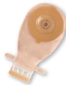
TRANS/OVERLAP SMALL BAG