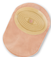
TRANS/OVERLAP LARGE BAG

*Oval wafer bags can be cut up to 110mm wide and 70mm deep.