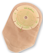
TRANS/OVERLAP SMALL BAG